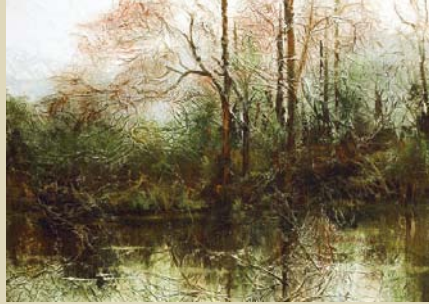
Mepkin View III